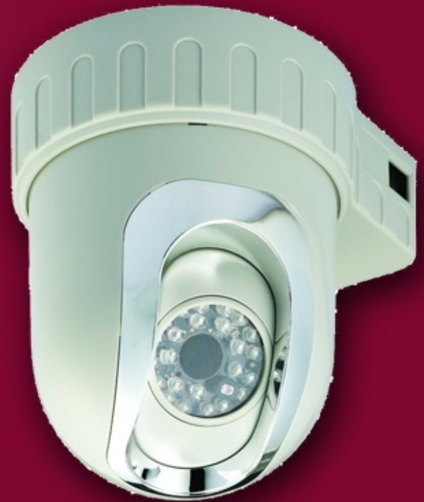
EK350 SERIES INFRARED IP DOME CAMERA