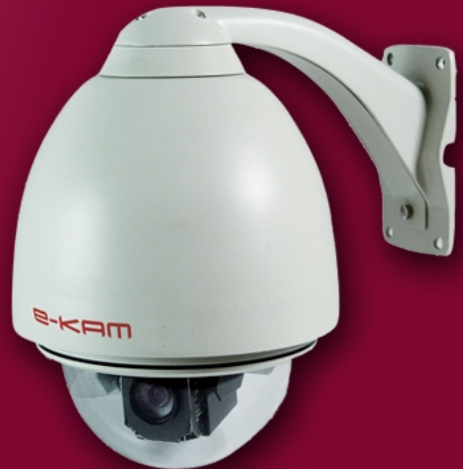
EK300 SERIES INTELLIGENT IP DOME CAMERA