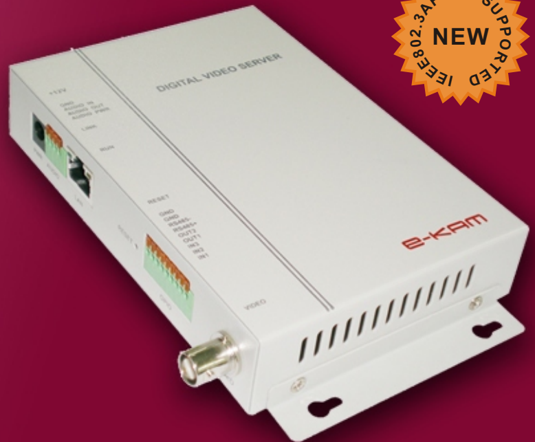
EK200 SERIES IP VIDEO SERVER